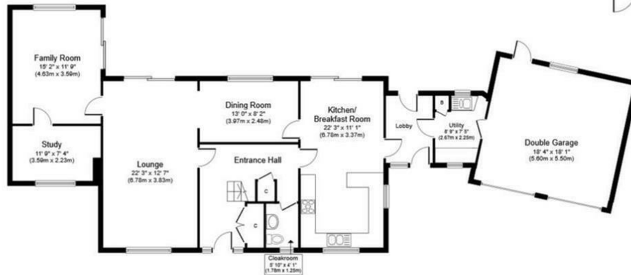
Ground Floor Approximate Floor Area 1,223 sq. ft. (113.6 sq. m.) (Not including garage)