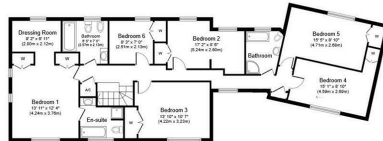
First Floor Approximate Floor Area 1,276 sq. ft. (118.5 sq. m.)

Whilst every attempt has been made to ensure the accuracy of the floor plan contained here, measurements of doors, windows, rooms and any other items are approximate and no responsibility is taken for any error, omission or mis-statement. The measurements should not be relied upon for valuation, transaction and/or funding purposes. This plan is for illustrative purposes only and should be used as such by any prospective purchaser or tenant. Systems and appliances shown have not been tested and no guarantee as to their operability or efficiency can be given.